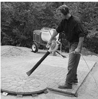
Figure 6. Whether using liquid or dry joint stabilization materials, the surface of the pavers should be cleaned with a blower or broom after the joint sand is compacted into the joints.

Joint sand gradation can affect the depth of penetration of the liquid stabilizer. The amount of fines or material passing the No. 200 (0.075 mm sieve) can influence the depth of penetration. A joint sand gradation with less than 5% passing the No. 200 (0.075 mm) sieve can allow better penetration of liquid stabilizers. A job site mock-up should be