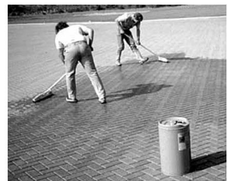
Figure 10. Urethane is applied with squeegees to stabilize joint sand between pavers on aircraft pavement.

Sealer should be spread and allowed to stand in the chamfers, soaking into the joints. Penetration