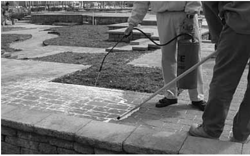
Figure 3. This liquid joint sand stabilizer is applied with a low-pressure sprayer and squeegeed across the surface after allowing some time for soaking into the joints. This helps maintain slip and skid resistance of the paver surface.