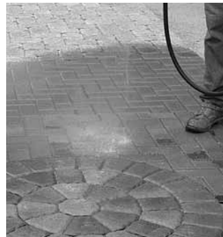
Figure 7. Dry-applied joint sand with a stabilizer is wetted in order to activate it and stiffen the sand. Once the joints dry, they are stabilized.