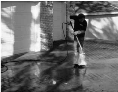
Figure 2. Pressurized cleaning equipment used by professional cleaning and sealing companies can bring out the best appearance from pavers.

Always refer to the paver supplier or chemical company supplying the chemicals for recommendations on proper dilution and application of chemicals for removal of efflorescence. They are generally applied in sections beginning at the top of slope of the pavement. If the area is large, a sprayer is an efficient means to apply the cleaner. The chemicals are scrubbed on