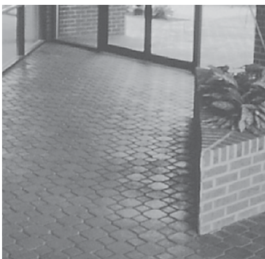
Figure 1. Many sealers enhance the appearance of concrete pavers and protect against staining.

Removal of several common stains from Removing Stains from Concrete are listed below (1). Most involve typical household chemicals. Searching the internet using the key