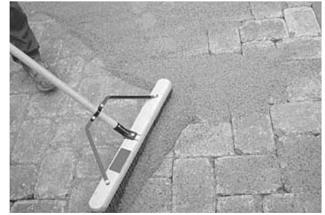
Figure 5. Joint sand can be pre-mixed and delivered to the site (typically in bags), or mixed with stabilizer at the site, then swept into the joints, compacted for consolidation in them to create interlock, and wetted to activate the stabilizer.

depends on the amount and sources of traffic, plus sources of fines that work their way into the joints from traffic over time.