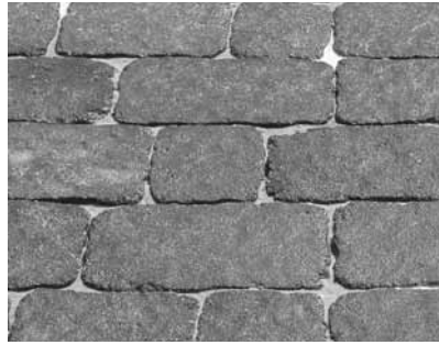
Figure 4. Liquid joint sand stabilizers can deepen the surface color slightly and they provide some surface sealing as well. Tumbled pavers shown here have wider joints than other shapes. These type of pavers can require stabilization of the joint sand.