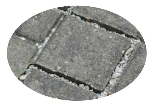
Permeable joint material consisting of small aggregates allows infiltration of stormwater.