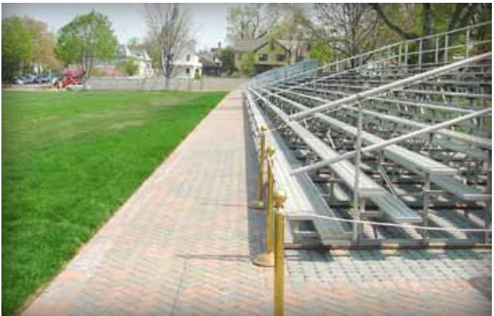
PICP under bleachers at the U.S. Naval Academy in Annapolis, MD provides structural support and on-site infiltration.

PICP makes a useful instructional tool for engineering, architecture, landscape architecture and construction students. The outdoor classroom provides a demonstration site to monitor performance and maintenance aspects and can have a lasting impact on students as they move into their careers.