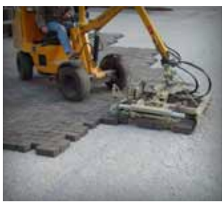
Mechanical installation equipment accelerates construction; typical 5,000 sf (500 m²)/machine/day. After placement, joints and/or openings filled with small aggregate and pavers are compacted.