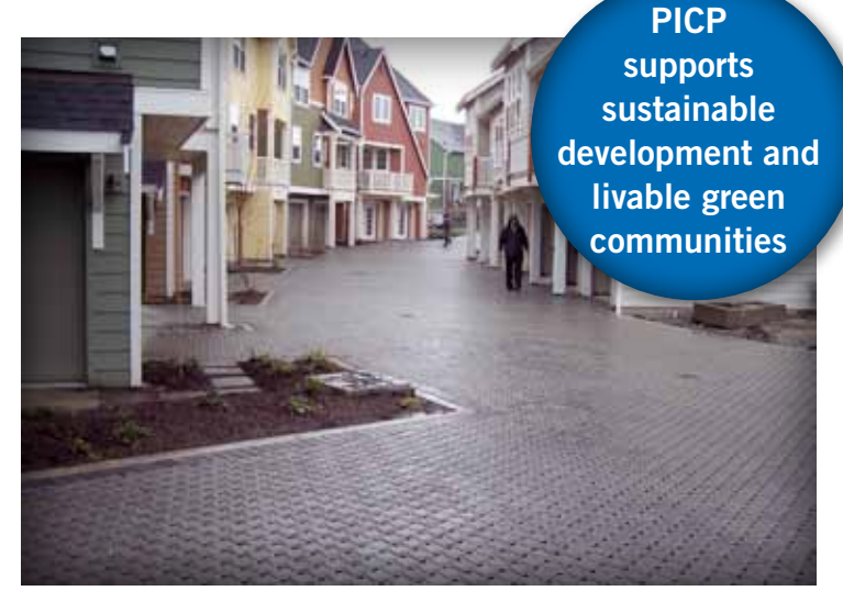
PICP's can eliminate street storm drains and sewer pipes as in this redevelopment project in Seattle,WA.

Permeable interlocking concrete pavement (PICP) with open-graded base and subbase for infiltration and storage.