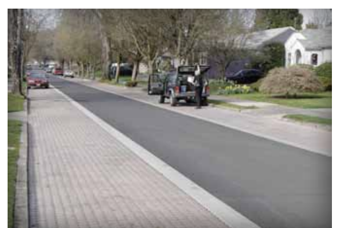
Prepared subgrade for 20,000 sf (2000 m²) Portland, OR street retrofit with PICP