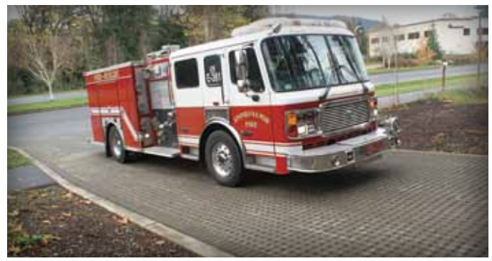
This PICP fire station driveway in Snoqualmie, WA eliminates runoff during most rainstorms.