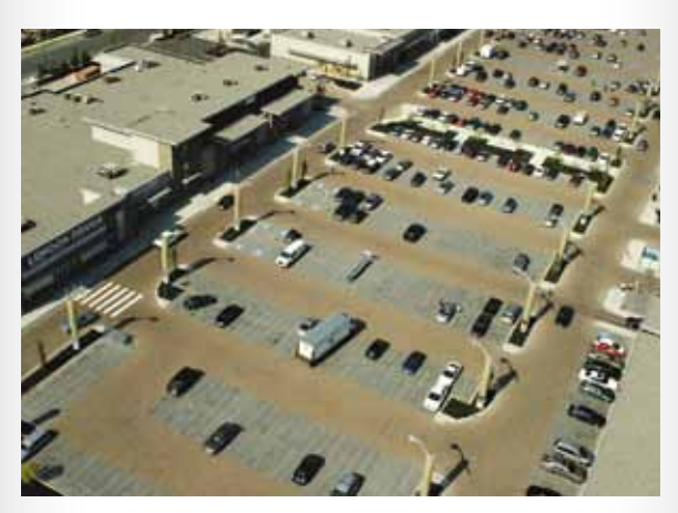
350,000 sf (3.2 ha) of PICP at a Burnaby, BC shopping center infiltrates runoff from roofs.