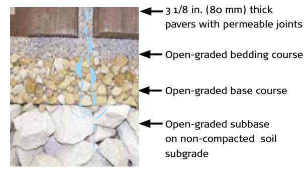
Permeable interlocking concrete pavement (PICP) with open-graded base and subbase for storage and infiltration.