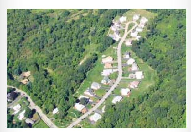
By eliminating detention pond, the subdivision layout conserves trees while 15,000 sf (1500 m²) PICP in the cul-de-sac returns rainfall to the water table in Glen Brook Green subdivision in Waterford, CT.