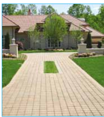
PICP driveway in NC creates an attractive and environmentally responsive entrance.