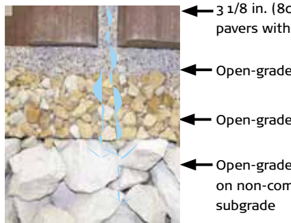
3 1/8 in. (80 mm) thick pavers with permeable joints