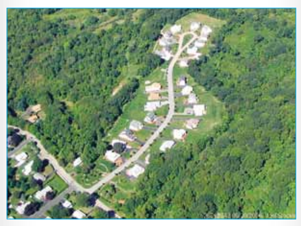
With no detention pond, layout conserves trees while 15,000 sf (1500 m²) PICP in the cul-de-sac returns rainfall to the water table in Glen Brook Green subdivision in Waterford, CT.