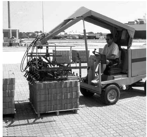
Figure 3. A cluster of pavers (or layer) is grabbed for placement by mechanical installation equipment. The pavers within the cluster are arranged in the final laying pattern as shown under the equipment.

in overall cluster size. Mixing pavers from a larger mold with a smaller mold may cause installation problems.