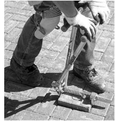
Figure 11. During initial compaction, cracked pavers are removed and immediately replaced with whole units.

from cutting operations to collect or drain on the bedding sand, joint sand or in unfinished joints. Figure 9 shows a cutting with a dust collection system to prevent contamination of surfaces. If such contact occurs, remove and replace the affected materials.