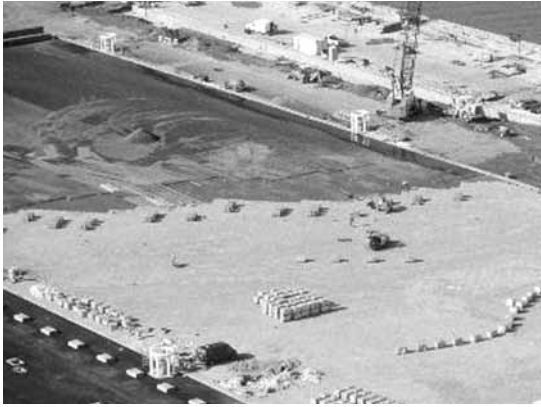
Figure 7. Maintaining an angular laying face that resembles a saw-tooth pattern facilitates installation of paver clusters.

able width of clusters. The installation subcontractor will determine exact intervals for lines.