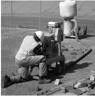
Figure 9. Edge pavers are saw cut to fit against a drainage inlet.