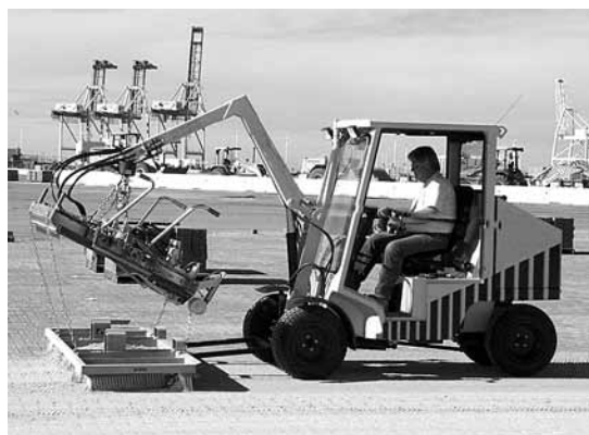
Figure 12. Sweeping jointing sand across the pavers is done after the initial compaction of the concrete pavers.

Coordination and Inspection—Large areas of paving are placed each day and often require inspection by the engineer or other owner's representative prior to initial and final compaction. Inspection should keep up with the