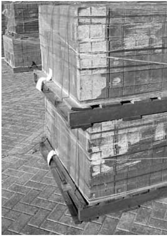
Figure 2. Bundles of ready-to-install pavers for setting by mechanical equipment. Bundles are often called cubes of pavers.

be consulted for additional information on design and construction with this paving method. Other references include American Society for Testing and Materials or the Canadian Standards Association for the concrete pavers, sands, and joint stabilization materials, if specified. Placement of the base, drainage and related earthwork should be detailed in another specification section and may be performed by another subcontractor or the GC.