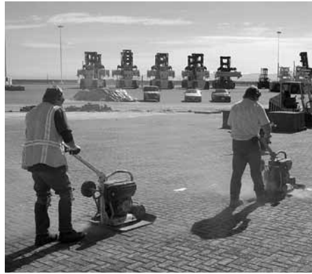
Figure 10. Initial compaction sets the concrete pavers into the bedding sand.