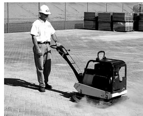
Figure 13. Final compaction should consolidate the sand in the joints of the concrete pavers.