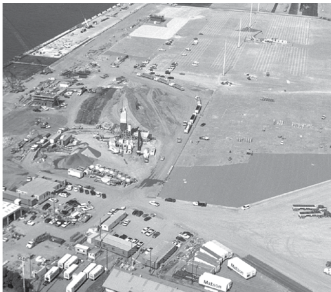
Figure 14. The Port of Oakland, California, is the largest mechanically installed project in the western hemisphere at 4.7 million sf (470,000 m 2 ).

ASTM D 7428 Standard Test Method for Resistance of Fine Aggregate to Degradation by Abrasion in the Micro-Deval Apparatus, Annual Book of ASTM Standards , Vol 04.03, ASTM International, Conshohocken, Pennsylvania, 2008.