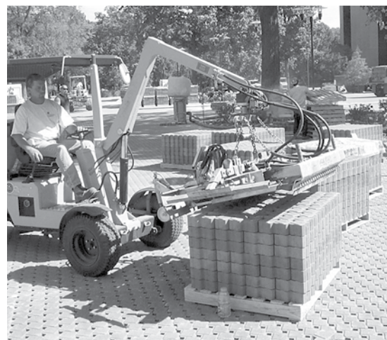
Figure 1. Mechanical installation of interlocking concrete pavements (left) and permeable units (right) is seeing increased use in industrial, port, and commercial paving projects to increase efficiency and safety.