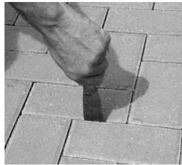
Figure 14. A simple test with a putty knife checks consolidation of the joint sand.

are 1%. Surface elevations should conform to drawings. The top surface of the pavers may be 1/8 to 1/4 in. (3 to 6 mm) above the final elevations after the second compaction. This helps compensate for possible minor settling normal to pavements. The surface elevation of pavers should be 1/8 to 1/4 in. (3 to 6 mm) above adjacent