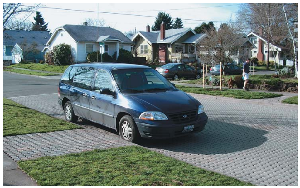
The City of Portland utilized over 19,000 sf of permeable Ecoloc<sup>®</sup> interlocking concrete pavers in a pilot project in the Westmoreland neighborhood

he City of Portland, long considered a leader in the protection of the environment in the northwestern United States, is building sustainable stormwater projects around the city to reduce the detrimental impacts of stormwater runoff on the Willamette River and surrounding tributaries.