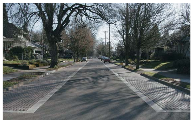
The center travel asphalt lane slopes towards the permeable Ecoloc® pavers to capture and infiltrate stormwater runoff

"The Westmoreland permeable paver streets appear to function hydraulically as designed, in spite of the weed growth," added Steve Burger. Test results show that infiltration is still rapid, infiltrating all flow before it reaches the curb line. Information on the project is included on the city's website, www.portlandonline.com.