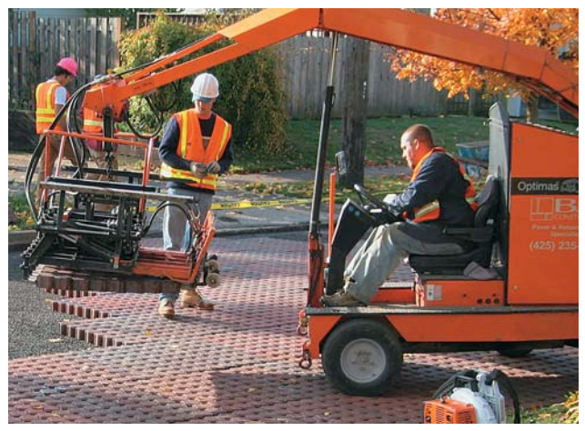
Mechanized installation allows for fast placement of Ecoloc®

ni-Group U.S.A. manufacturer Mutual Materials, Inc. supplied the 3 <sup>1</sup>/<sub>8</sub> in. (80mm) thick Ecoloc® permeable interlocking pavers used in the project. The company worked closely with the city and consulting engineers to help ensure the project's goals were met.