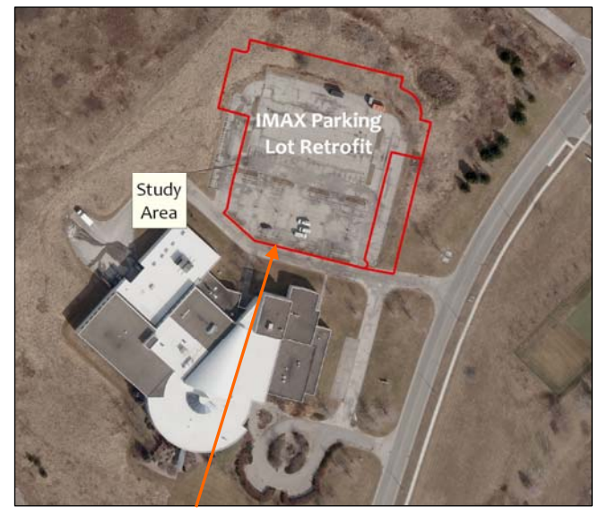
Aerial photograph of the site, showing the extent of the expanded parking lot.

Demonstration Showcase – LID features at IMAX Corporation have been showcased through numerous presentations, events, media and site tours.