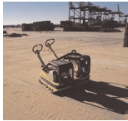
After an area was paved, large plate compactors like these compacted the concrete pavers into the bedding sand. The machines were also compacted the units again after the joints were filled with sand.