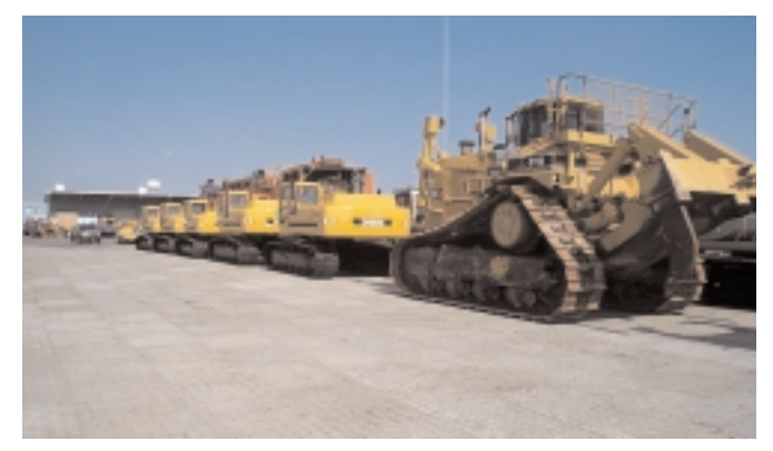
High abrasion resistance to steel tracked equipment is why over a half a million square feet (over 50,000 m<sup>2</sup>) of concrete pavers were used at Dundalk in the Port of Baltimore.

charge (weight) over the entire area of soil. The weight of the sand slowly compressed the soil and pushed excess water into wick drains in the soil. The weight of sand on the dredged soil caused settlement in the soil as much as seven feet (2.1 m) in some places.