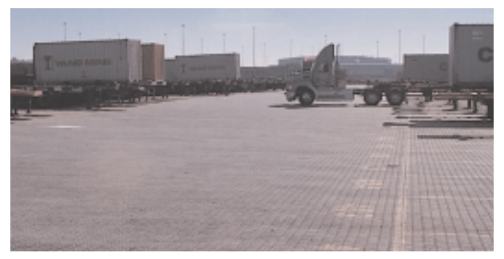
In 1997, the next install installment was about 560,000 sf (56,000 m<sup>2</sup>) at Seagirt, now used for storage of truck chassis.

In 1997, a 5 ft. (1.2m) layer of sand on geotextile was placed as sur-