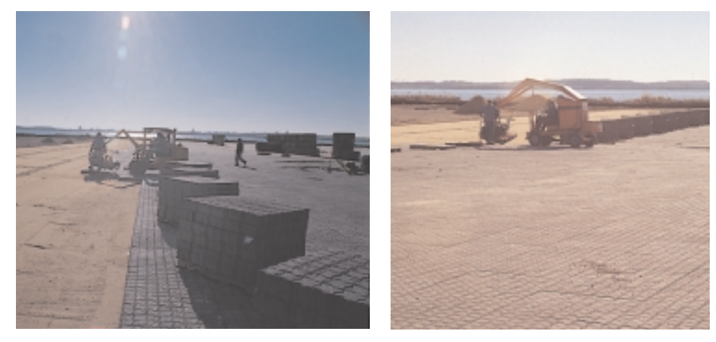
Like the past projects, recent construction of paving at Seagirt used mechanical equipment placing concrete pavers manufactured and stacked in the final laying pattern.