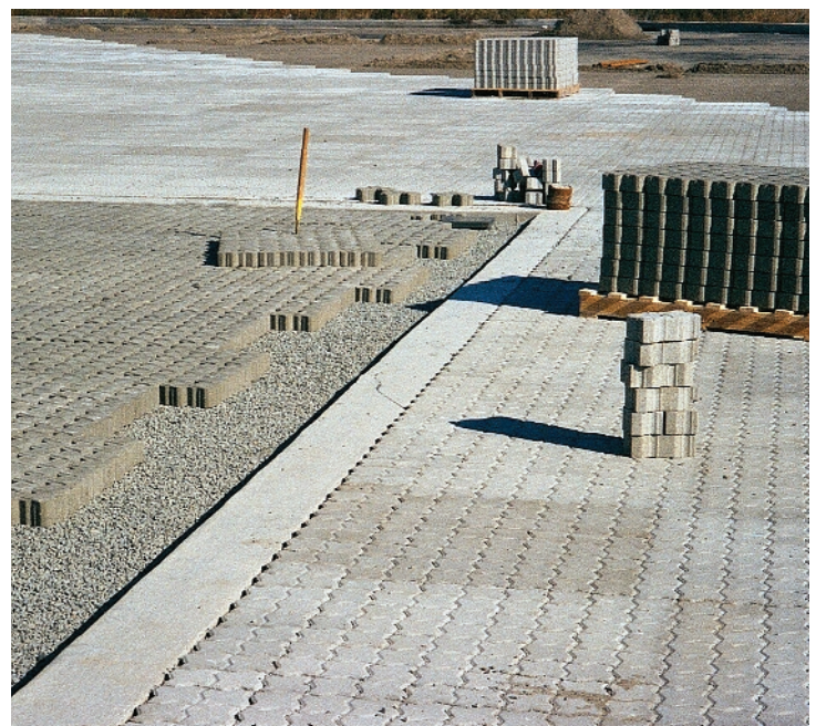
Figure 9. The permeable pavement test area is surrounded by solid interlocking concrete pavement. The pavers against the curb haven't yet been cut to fit against it.