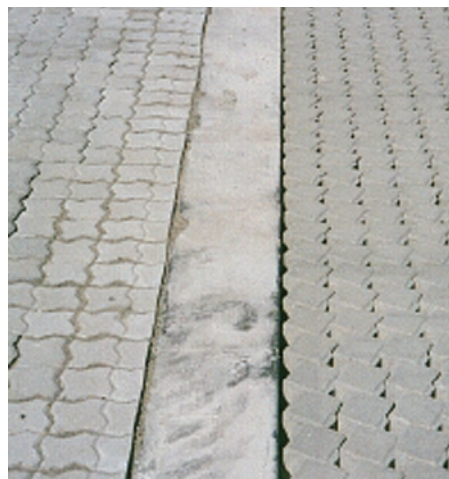
Figure 7. The two pavements are separated by a significant concrete edge restraint.

The typical construction for impervious port pavement includes a network of surface drain inlets and underground pipes often directed to retention ponds. The inlets, pipes, and ponds hold the water for a time, allowing the sediment to settle, and slowly releasing the remaining water. They take on sediment over time and have to be cleaned periodically by removing the sediment and disposing it in a landfill.