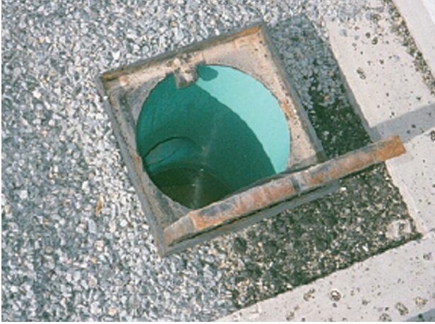
Figure 10. Essential to all permeable pavements, the Howland project included an observation well to monitor water levels, drainage rates, and sample water quality.

and maintaining a conventional drainage system and detention pond for water quality purposes will be greater than the additional periodic expense for vacuuming the surface and replacement of the aggregate in various places.