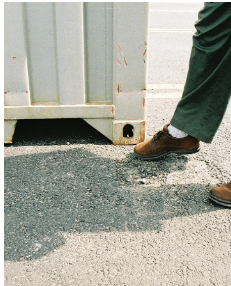
Figure 2. Unlike asphalt, concrete pavers can withstand loaded stacked containers that can exert over 50,000 lbs. (22,700 kg) at the corners without indentations that could interfere with container movement operations.