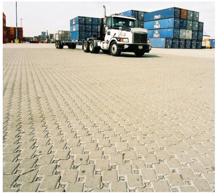
The Port Authority of New York and New Jersey placed some 13 acres (5.3) hectares of interlocking concrete pavements and a 0.25 acre (0.1 ha) test section of permeable interlocking concrete pavements for container yards.