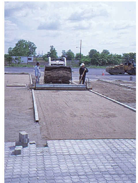
Figure 5. Powered screeding of the bedding sand accelerates its installation.