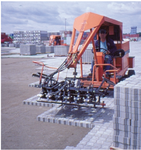
Figure 6. Mechanical equipment places the concrete pavers that are manufactured in the pavement laying pattern.