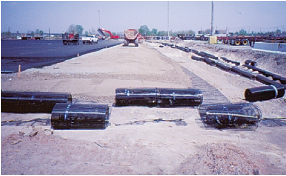
Figure 3. Cut away construction view of the base: soil subgrade covered with geogrid, recycled concrete aggregate base, and asphalt ready (left) for bedding sand and concrete pavers.

meable interlocking concrete pavement. As part of the larger interlocking pavement construction, a 0.25-acre (0.1 ha) section of permeable pavement combines the structural load-bearing capacity with a surface that allows runoff to infiltrate. The designers enabled an increase in useable port pavement area by selecting a surface which functions as a pavement for container storage and as a retention pond.