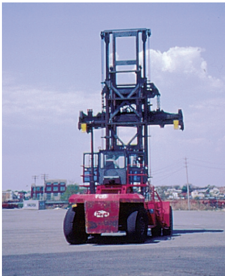
Figure 1. A top pick provides movement of the containers at Howland Hook while exerting wheel loads in excess of 50,000 lbs. (22,700 kg).